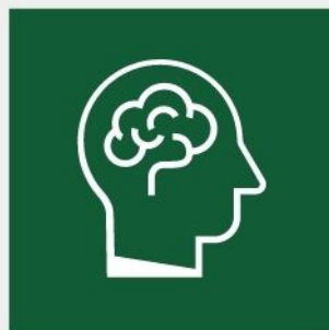
Cognitive Decline & Periodontitis